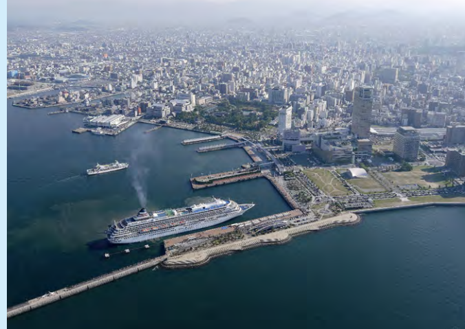
A Main Entrance to Takanatsu City, Sun port Takamatsu