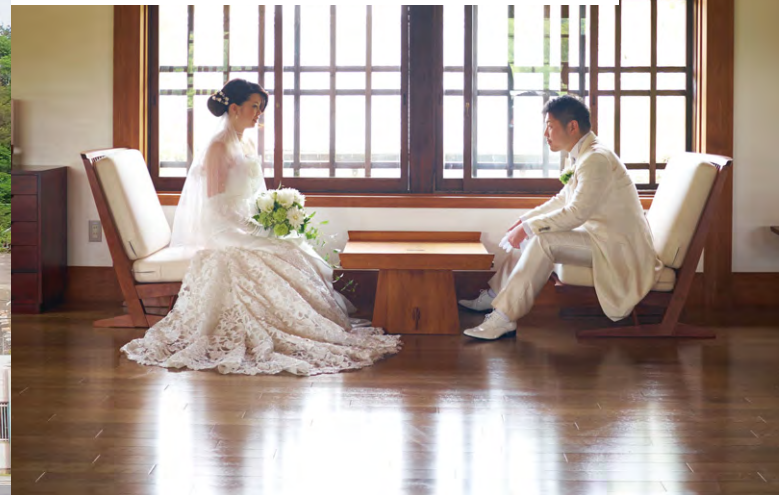
Photo wedding in a Japanese style space, wearing traditional Japanese attire. An easy way to have the Japanese bridal experience!